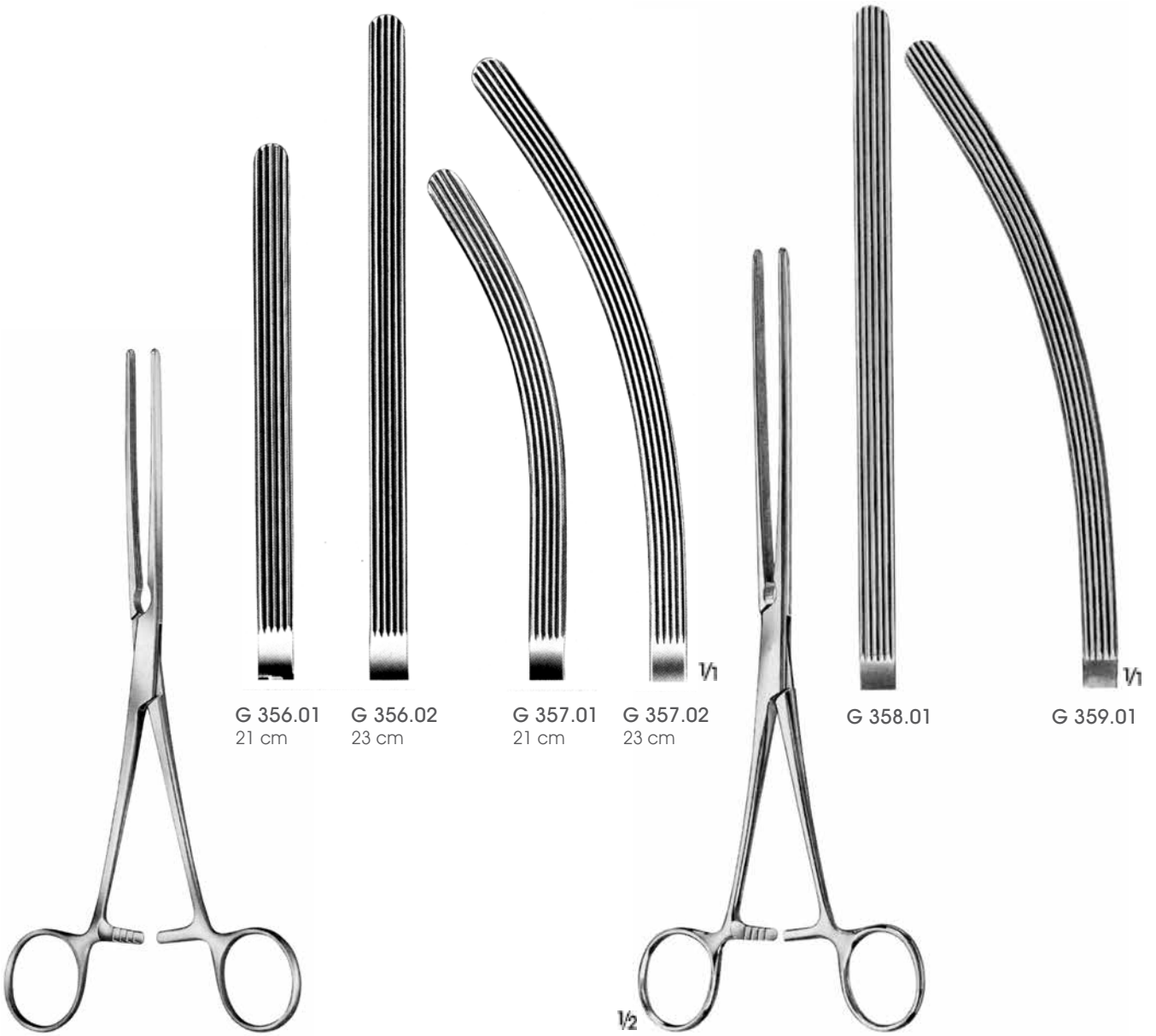
G 356.01 21 cm