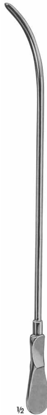
DITTEL J 080.08-J 080.30 Metal buji ve dilatasyon sondaları Metal bougies and dilating sounds 34.5 cm