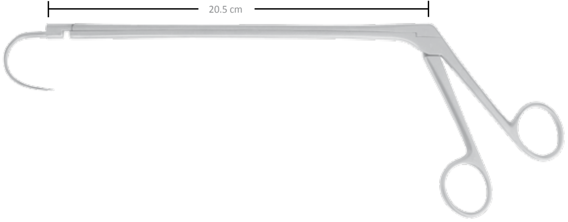
F 542.00 Sütur aleti/Suture instruments 25.4 cm