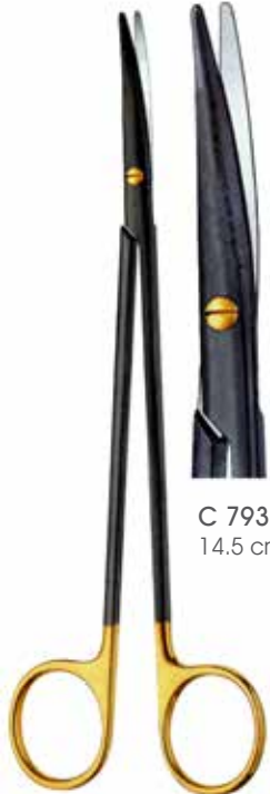
METZENBAUM C 793.01B-C 793.14B Tek ağız tırtıllı/One jaws serrated