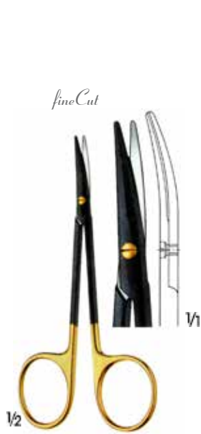
C 780.01B 11.5 cm