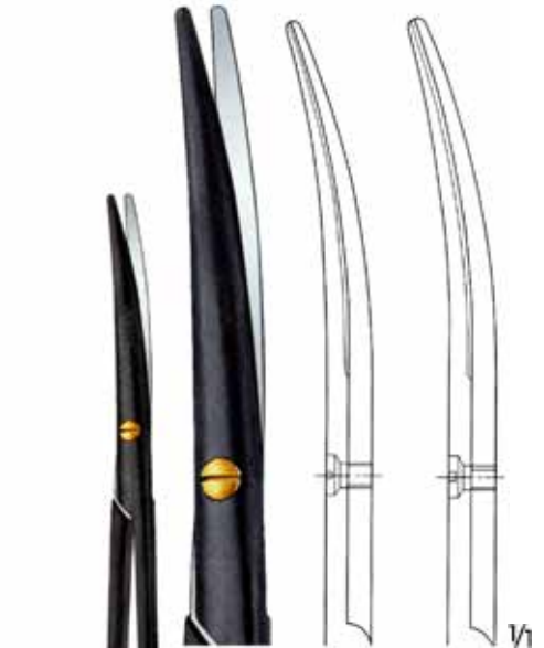
C 795.01B 16.5 cm C 795.02B 16.5 cm