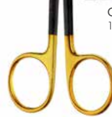
MAYO-LEXER C 795.01B-C 795.02B Tek ağız tırtıllı/One jaws serrated