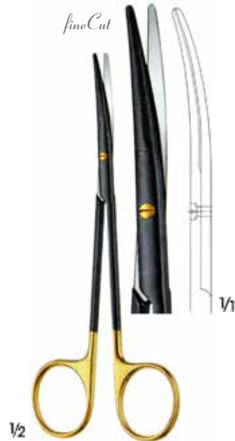
BABY-METZENBAUM C 782.01B 14.5 cm