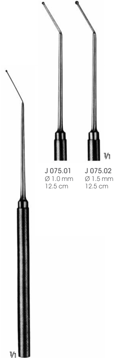
J 075.00 Ø 0.5 mm 12.5 cm