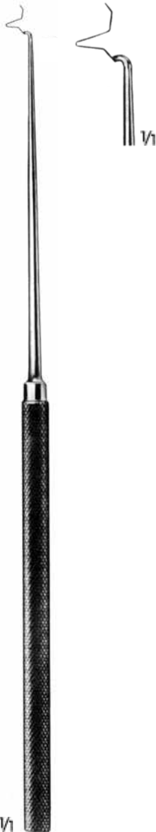
BIEMER T 080.00 3 mm Damar açıcı Vessel spreader 16 cm