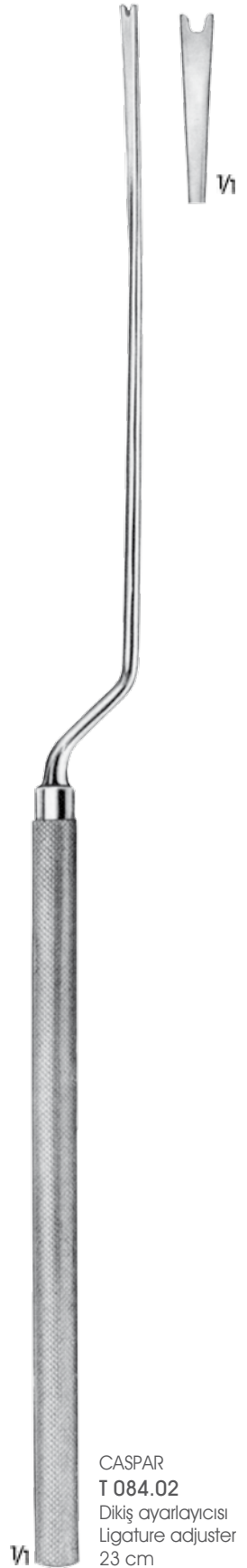
CASPAR T 084.02 Dikiş ayarlayıcısı Ligature adjuster 23 cm