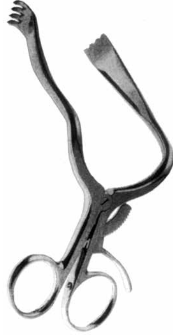
CROCKARD L 571.00 Küçük boy/Small size 18 cm L 571.01 Büyük boy/Large size 19 cm