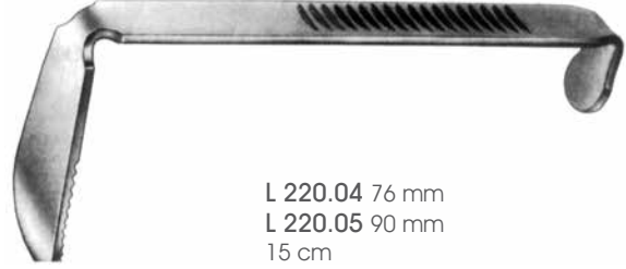
L 220.04 76 mm L 220.05 90 mm 15 cm