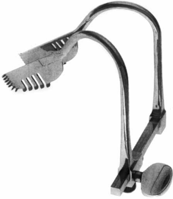
CROCKARD L 570.00 Tam boyu/Total length 11 cm Uc genişliği/Tip width 25 mm Sert damak ekartörü/Hard palate retractor