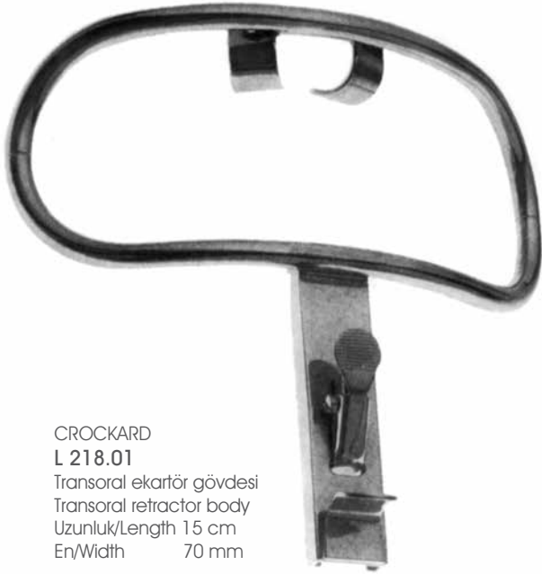
CROCKARD L 218.01 Transoral ekartör gövdesi Transoral retractor body Uzunluk/Length 15 cm En/Width 70 mm