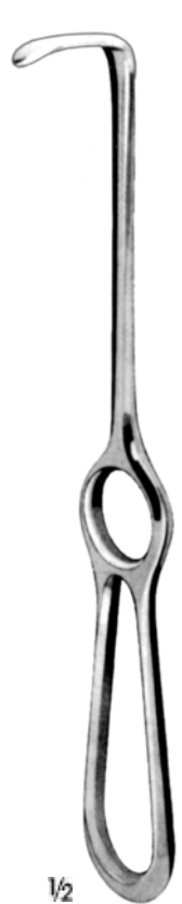
KOCHER-LANGENBECK K 452.01-K 452.10 21.5 cm