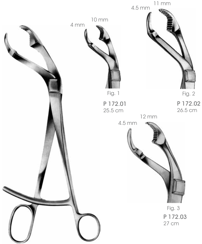
Fig. 1 P 172.01 25.5 cm