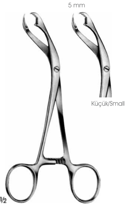
VERBRUGGE P 171.00 17.5 cm

P 170.01-P 170.05 Kendi kendini merkezleyici, vidalı sabit pensler Self-centering forceps with thread fixation