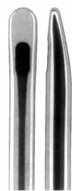
SPATULA J 478.00 2 mm 15 cm J 478.01 3 mm 15 cm J 478.02 4 mm 26 cm J 478.03 5 mm 26 cm J 478.04 6 mm 36 cm J 478.05 8 mm 45 cm