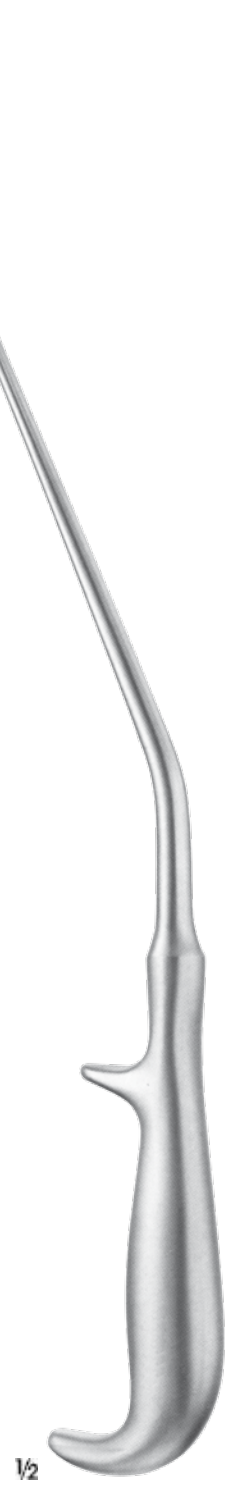
\frac{1}{2} K 726.01 Üretral ekartör Urethral retractor 39 cm