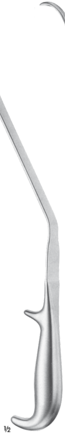
\frac{1}{2} K 726.00 Prostat ekartör Prostate retractor 36 cm