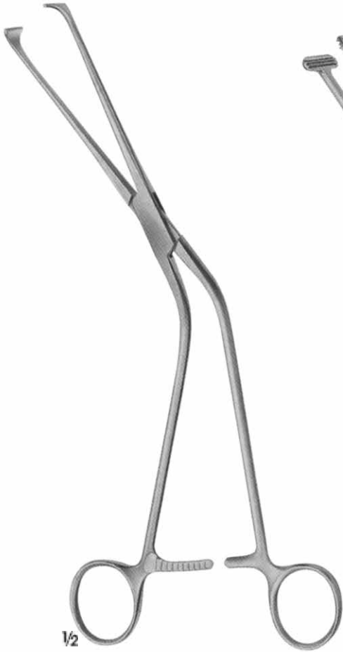
MILLIN E 534.00 Lobe yakalama pensi Lobe grasping forceps 23.5 cm