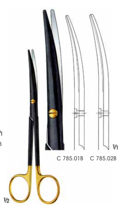
MAYO-LEXER C 785.01B-C 785.02B 16.5 cm