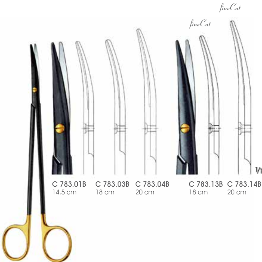
METZENBAUM C 783.01B-C 783.14B