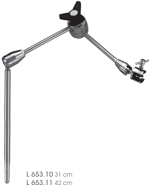
L 653.10 31 cm L 653.11 42 cm