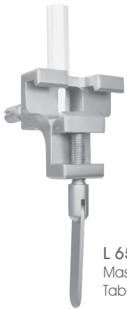
L 654.09 47x17 cm Masa bağlantı adaptörü Table connection adapter