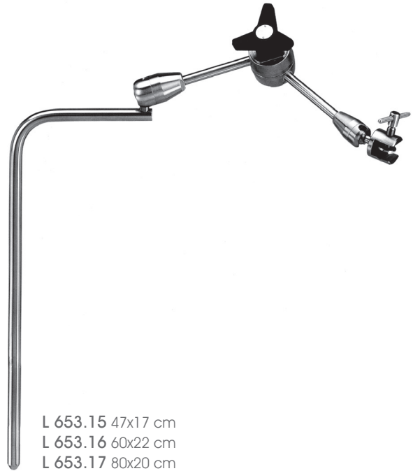
L 653.15 47x17 cm L 653.16 60x22 cm L 653.17 80x20 cm